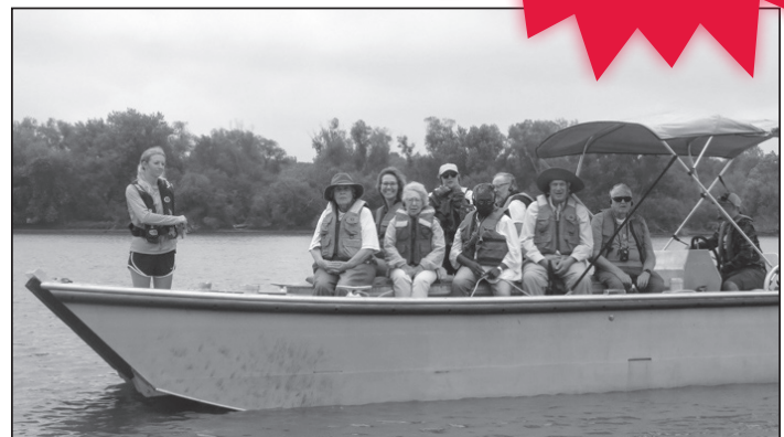
OLLI members enjoy a boat ride at the Illinois River Biological Station in Havana.