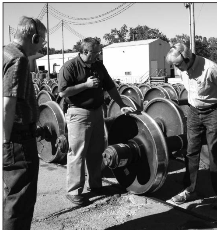
OLLI members learn about the inspection processes performed on railroad wheelsets used in freight railcars during a trip to Alliance Wheel in Washington.

$25 – includes lunch, gratuities, and tour